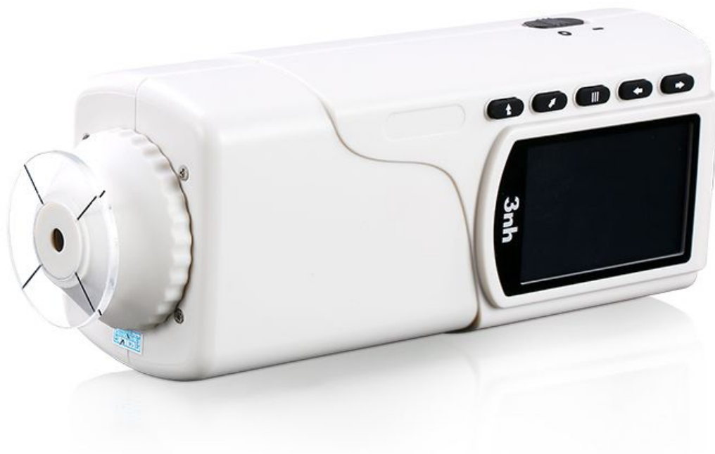
NR110 Precision Colorimeter