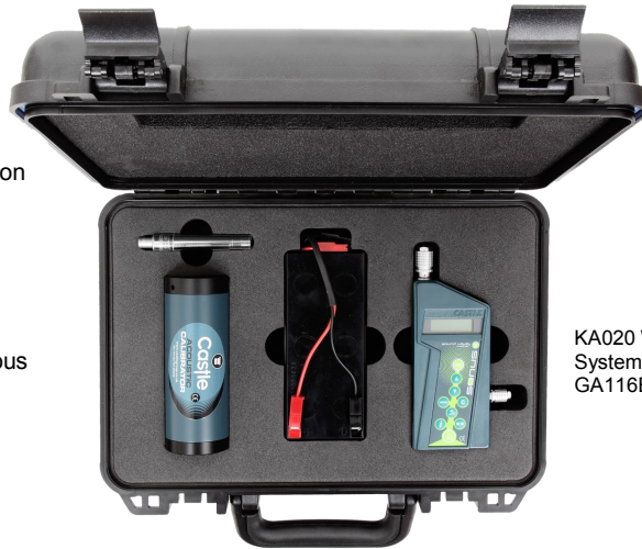
KA020 Weather proof System Case with GA116E & GA607

High Impact ABS plastic with membrane keypad