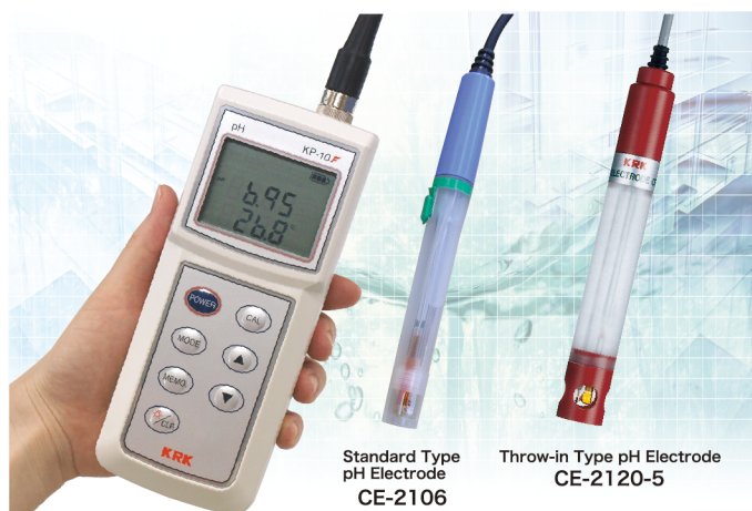
Standard Type pH Electrode CE-2106