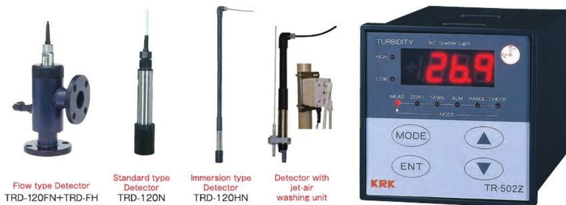
Flow type Detector TRD-120FN+TRD-FH